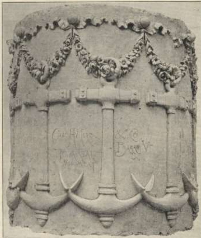
COLUMNS OF THE IOWA STATE SOLDIERS' MONUMENT.

Since securing this very important contract for the State of Iowa we have bought and taken possession of one of the largest granite