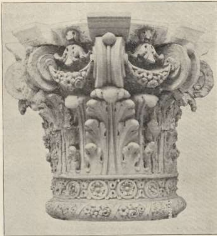
COLUMN OF THE IOWA STATE SOLDIERS' MONUMENT.

WE PRESENT our readers this month with an illustration of the most important part of the granite work for the Iowa Soldiers' Monument. This is the top capital and will be 12 ft. 6 in. in diameter and 11 ft. in height. The illustration shows only one section of the model completed. The first course or moulding as shown in the cut is a trifle more than one foot high, which will give some idea of the large scale upon which the carving is laid out. When in position this massive piece of work is to be seen at an elevation exceeding 100 feet, and it is to be regretted that work so elaborate in character and difficult of execution should be placed at such a height as to be practically lost to the casual observer. The contract for this important work is the largest that has ever been let in Barre, and we have spared no expense to thoroughly equip our plant with the necessary facilities for its satisfactory execution. Our friends in the trade and dealers in general when visiting Montpelier are cordially invited to visit our establishment and