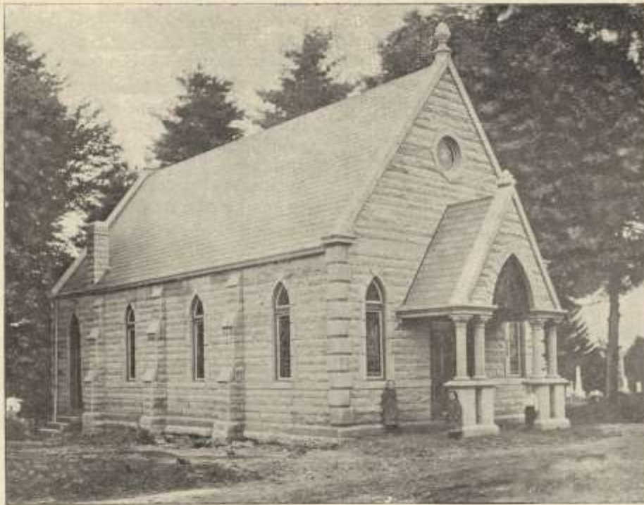
CHAPEL.—GROVE HILL CEMETERY, SHELBYVILLE, KY.