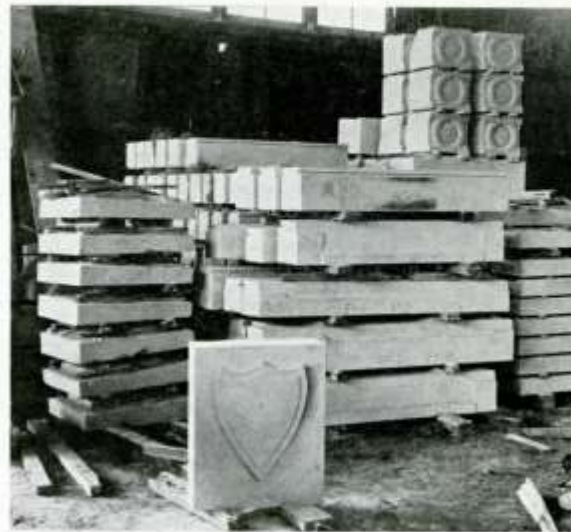
BLOCKS OF RECUT STONE

"The column supporting the statue of the navigator is placed upon an ample socle covered with sculptured scenes and figures," says a Rome correspondent of La Razon . "The front part of the socle is the bow of a Latin ship about to be launched into the sea by four