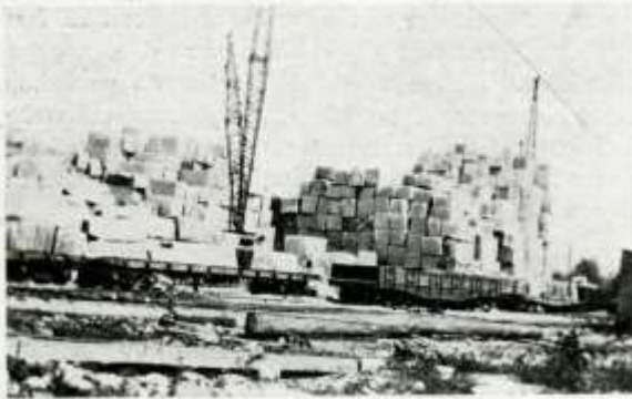
ONE MONTH'S QUARRYING

There is most unusual activity in the Indiana limestone district, in the quarrying and shipping of stone. The demand for the stone is unprecedentedly large from all parts of the country. A representative of the Consolidated Stone Company writes as follows of the activity at the Dark Hollow quarry: "All of our stripping is completed for the season and we are now quarrying in five openings. In one opening, without an additional penny to be spent for stripping, we have