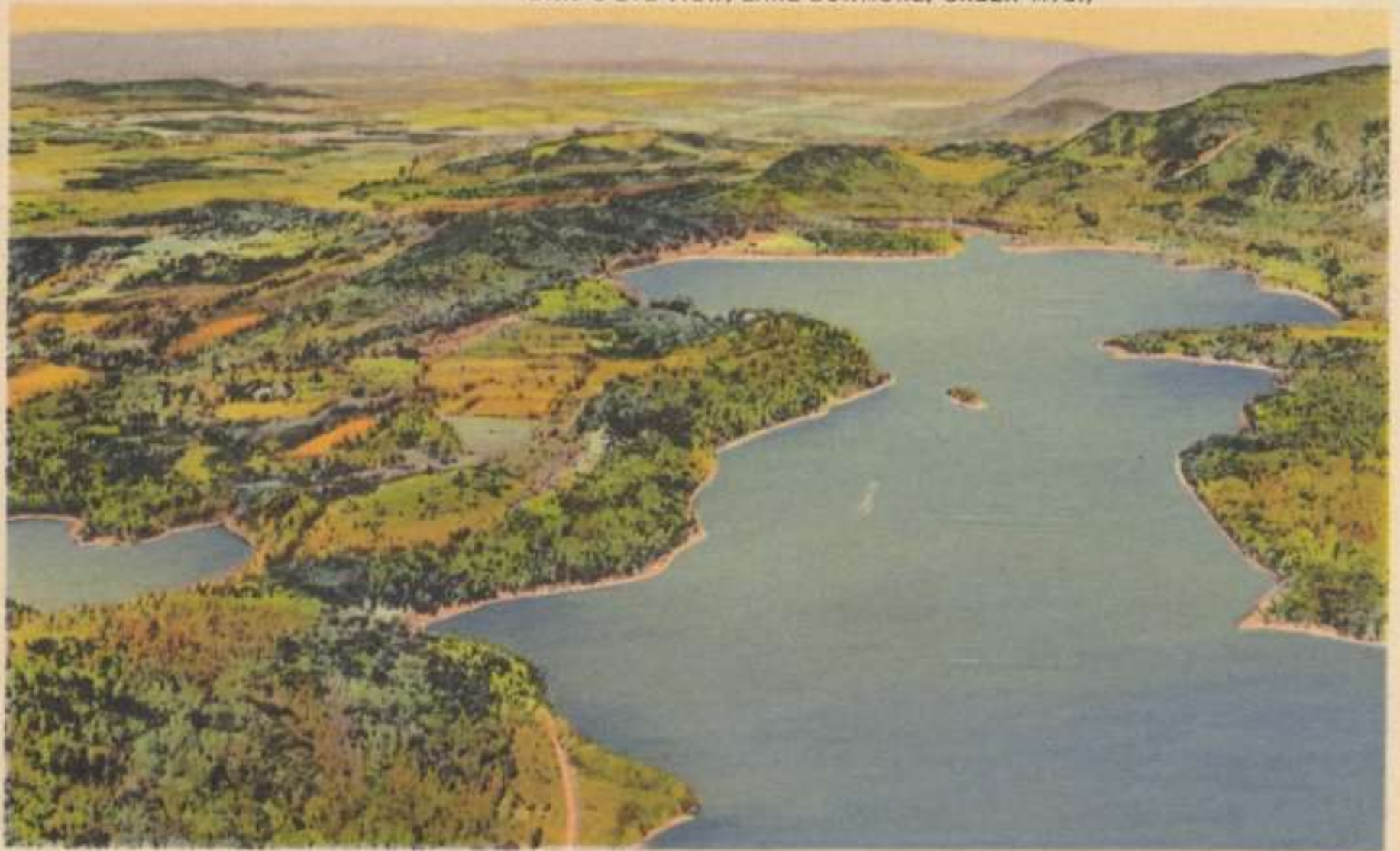
BIRD'S-EYE VIEW, LAKE DUNMORE, GREEN MTS.,