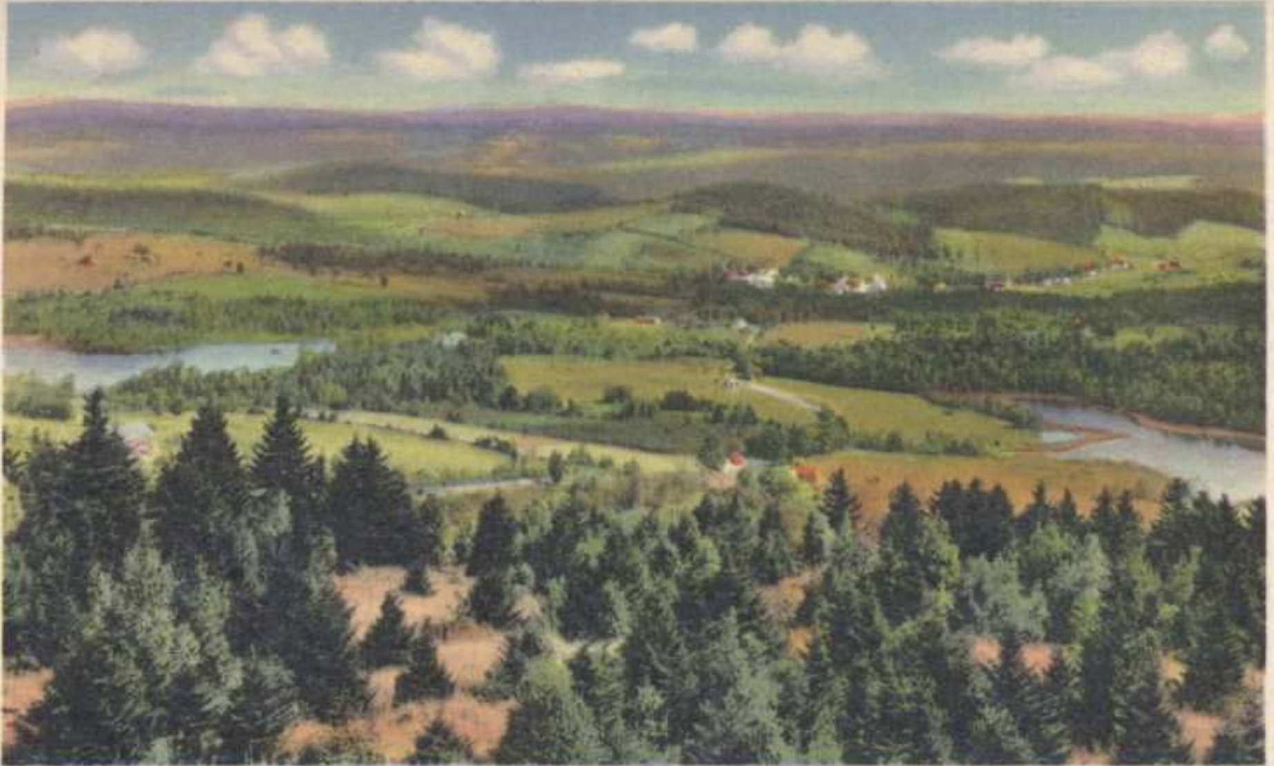
Looking toward Northfield, from Allis State Park, Green Mts., Vt.