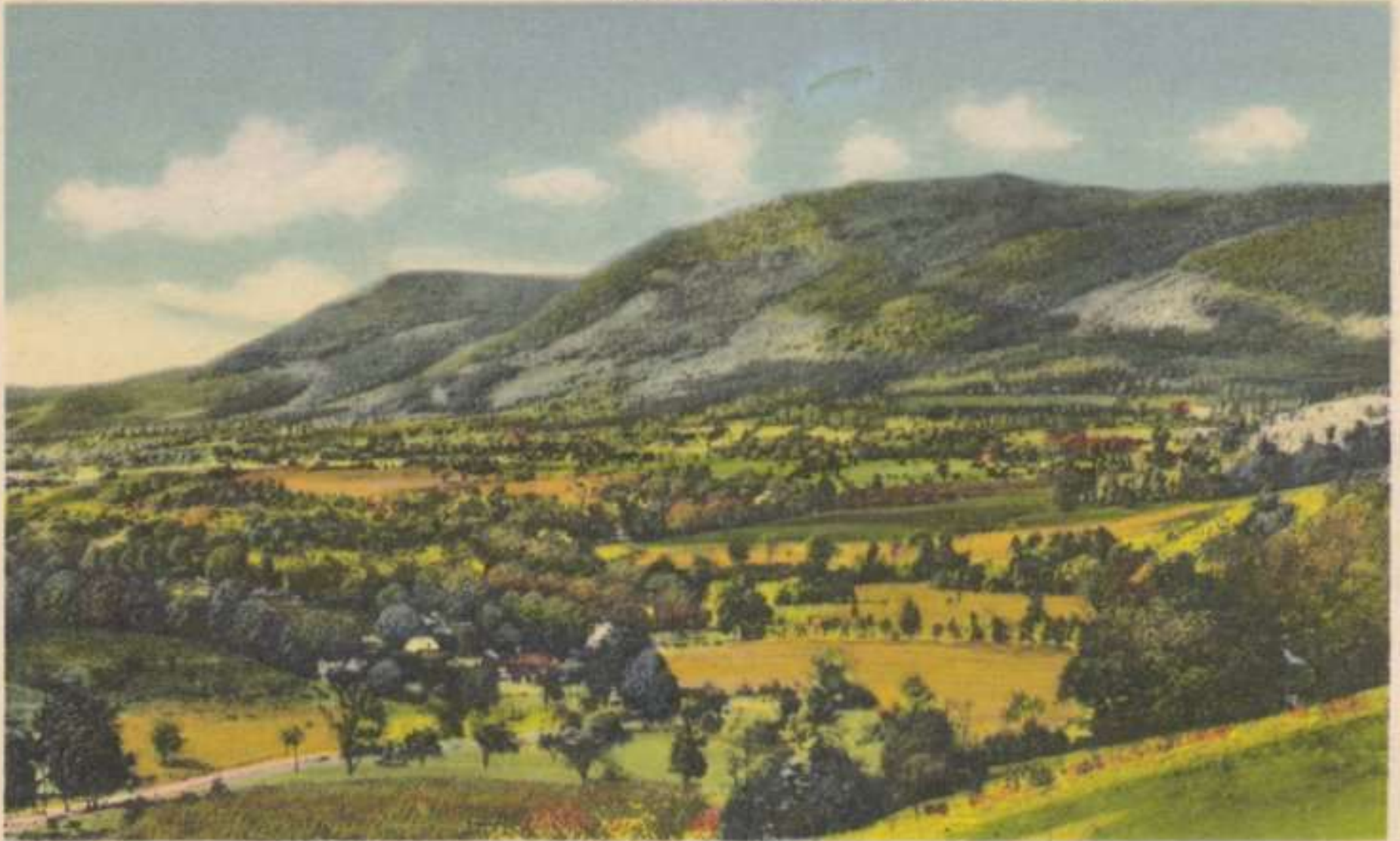
Mt. Equinox, Manchester, VT. Green Mts.