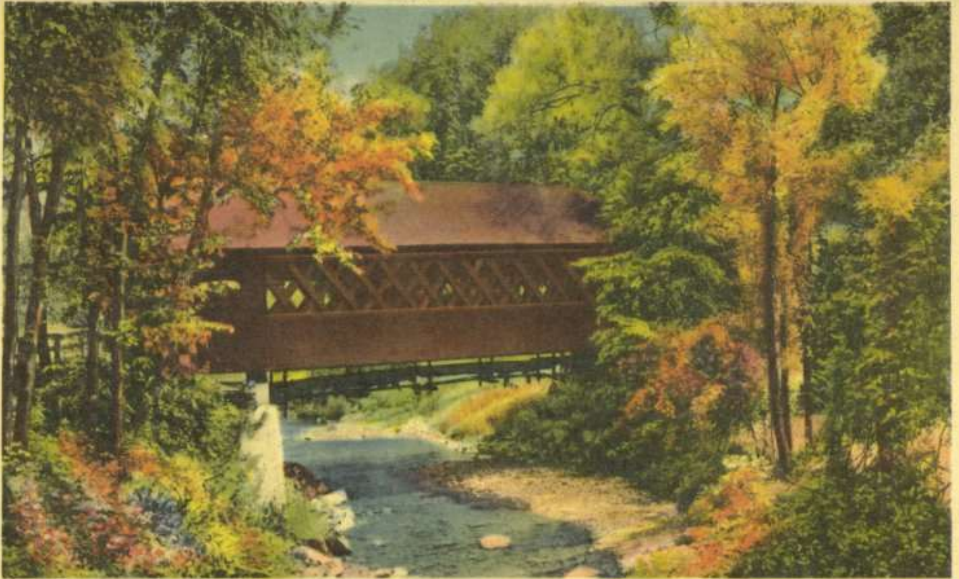
Covered Bridge, West Brattleboro, Ct., in the Green Mountains