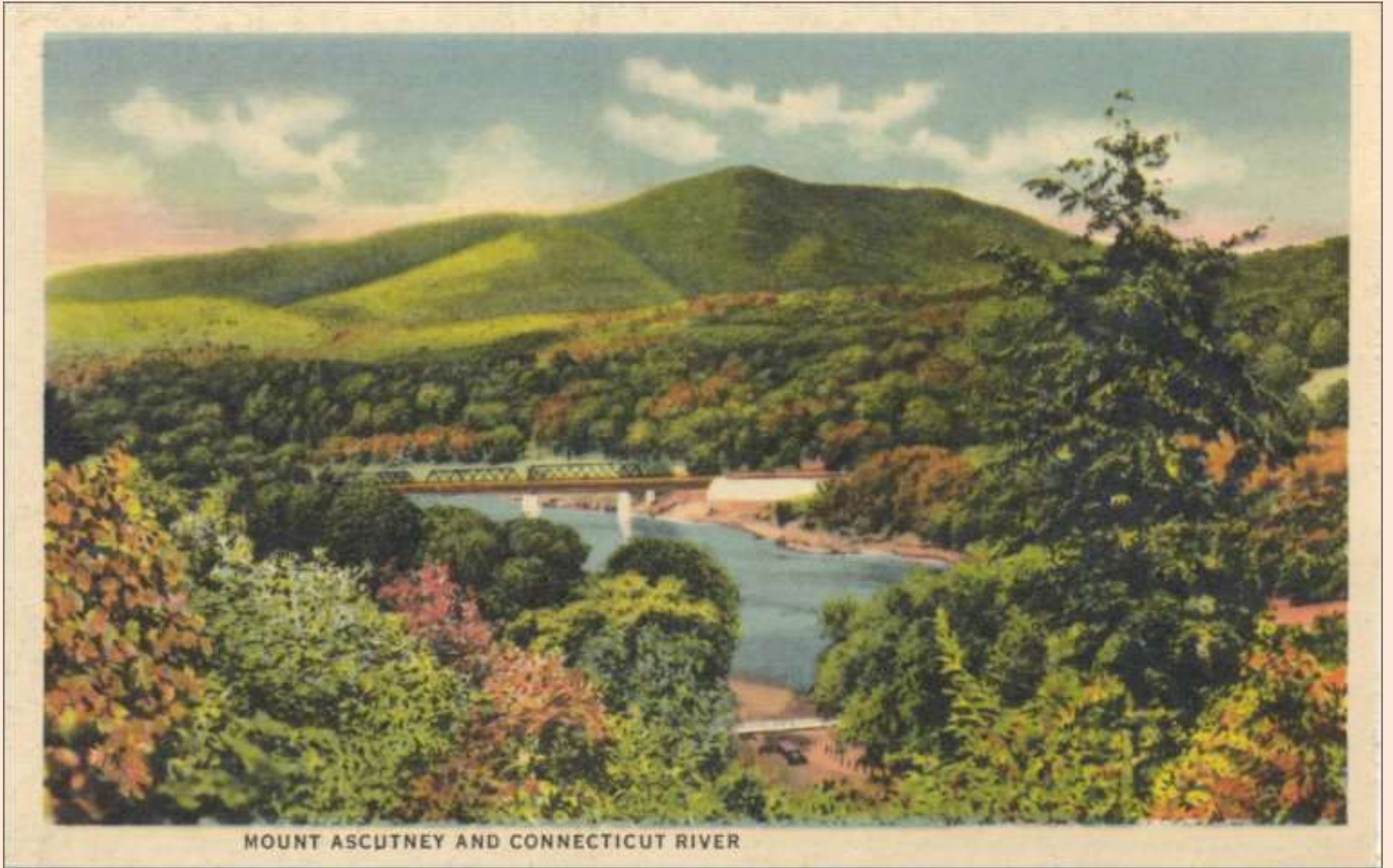
MOUNT ASCUTNEY AND CONNECTICUT RIVER