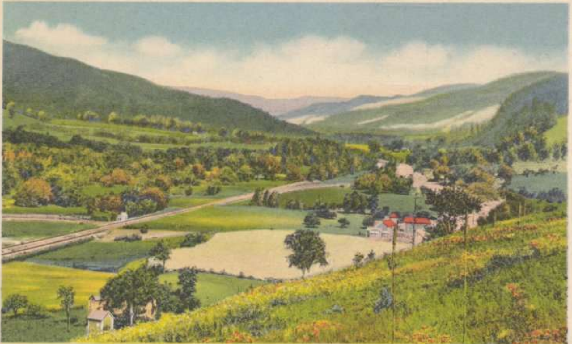
View from "The Brow" of Green Mts. and Pownal Valley, Pownal, Vt.