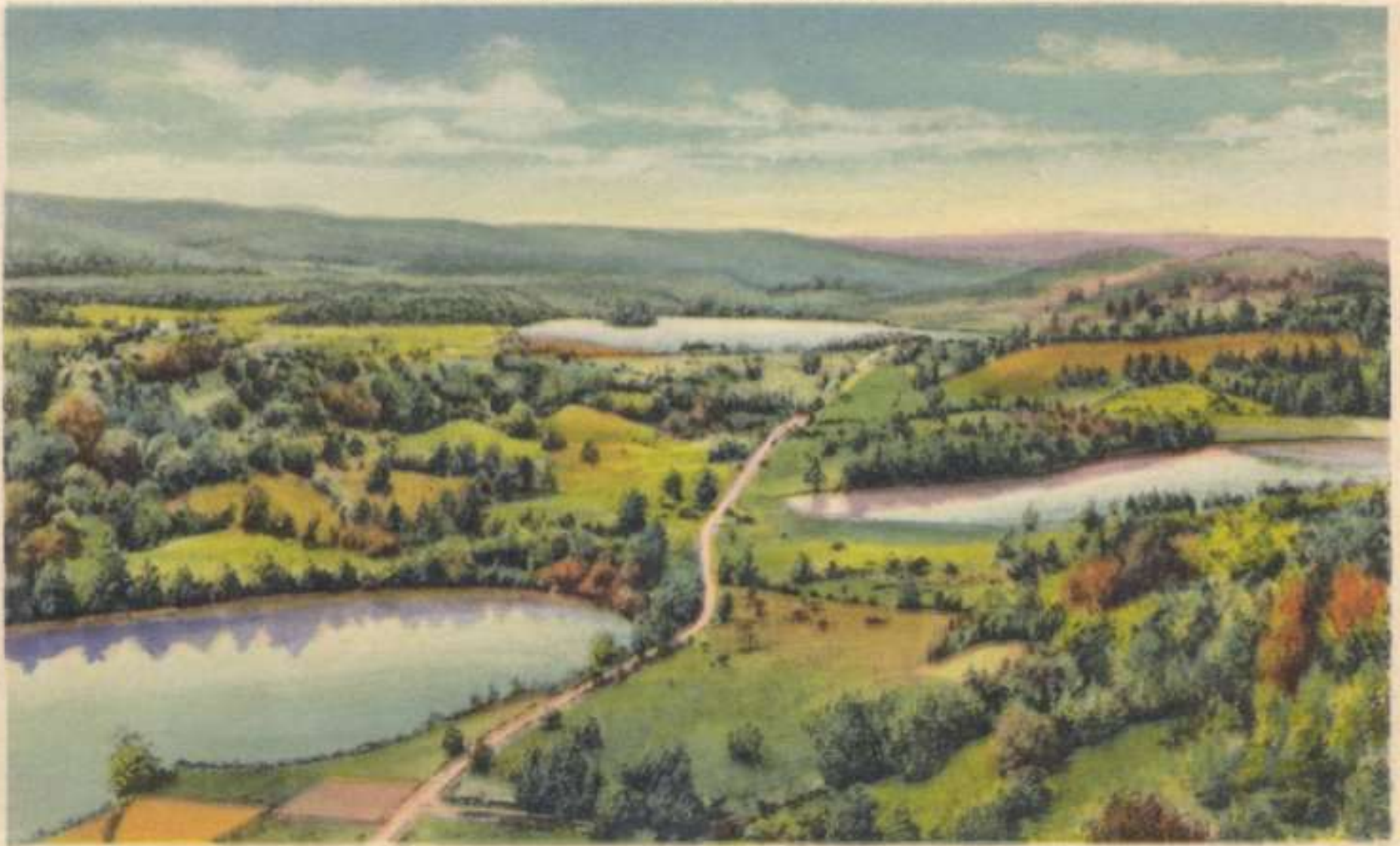
Hortonia, Echo and Bebee Lakes in the Green Mts. of Vermont