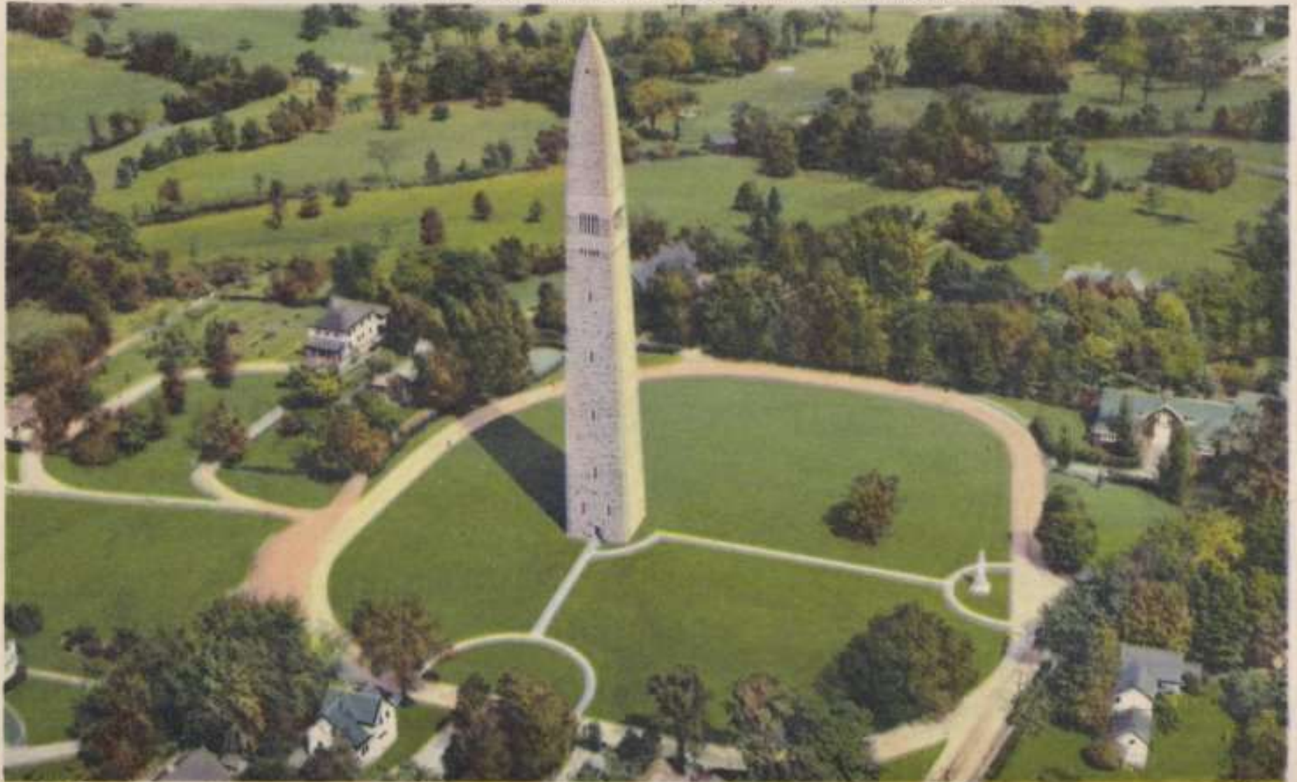
BIRD'S EYE VIEW, BATTLE MONUMENT, BENNINGTON, VT.