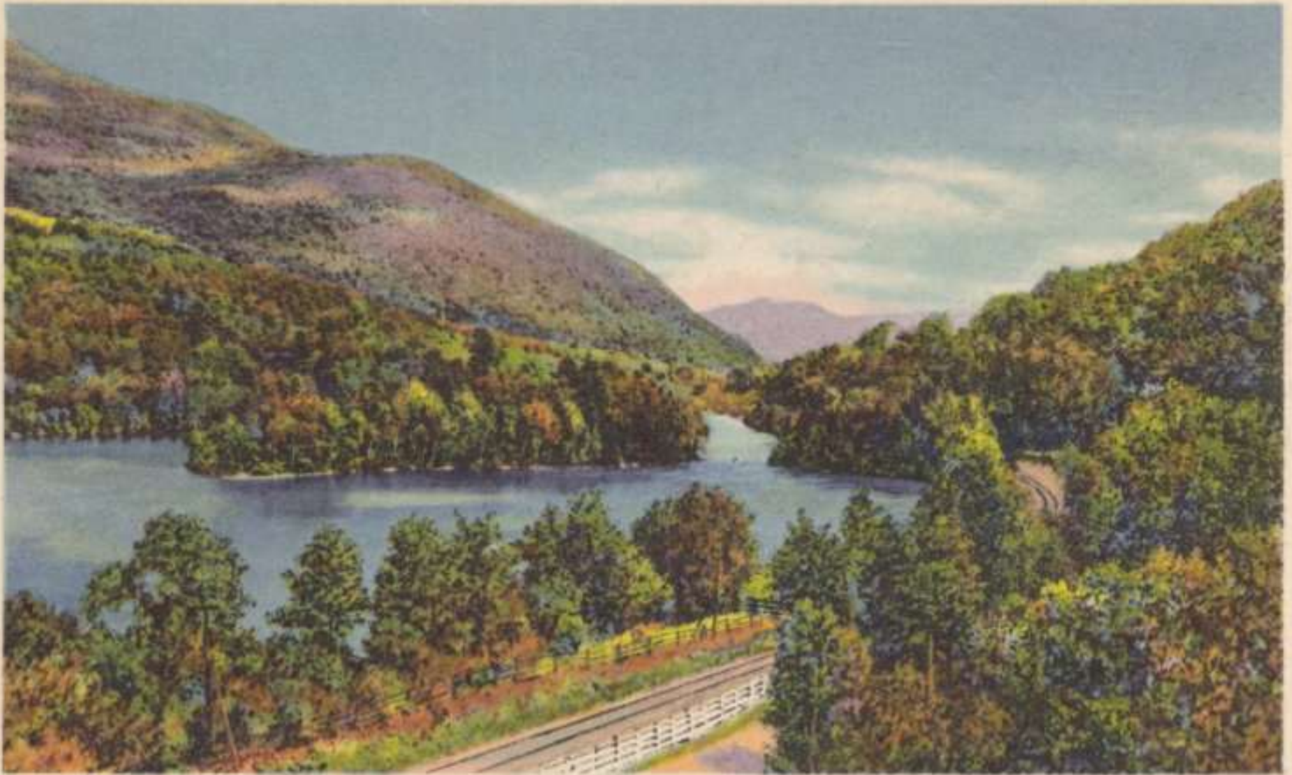
Emerald Lake in the Green Mountains, Vermont