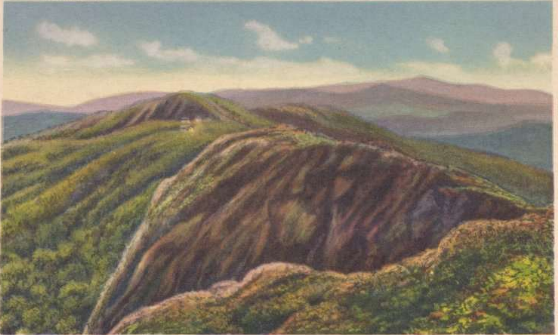
Mt. Mansfield, VT. Altitude 4364 Feet. Highest peak in the Green Mountains.

MT. MANSFIELD, VT. ALTITUDE 4364 FEET. HIGHEST PEAK IN THE GREEN MOUNTAINS.