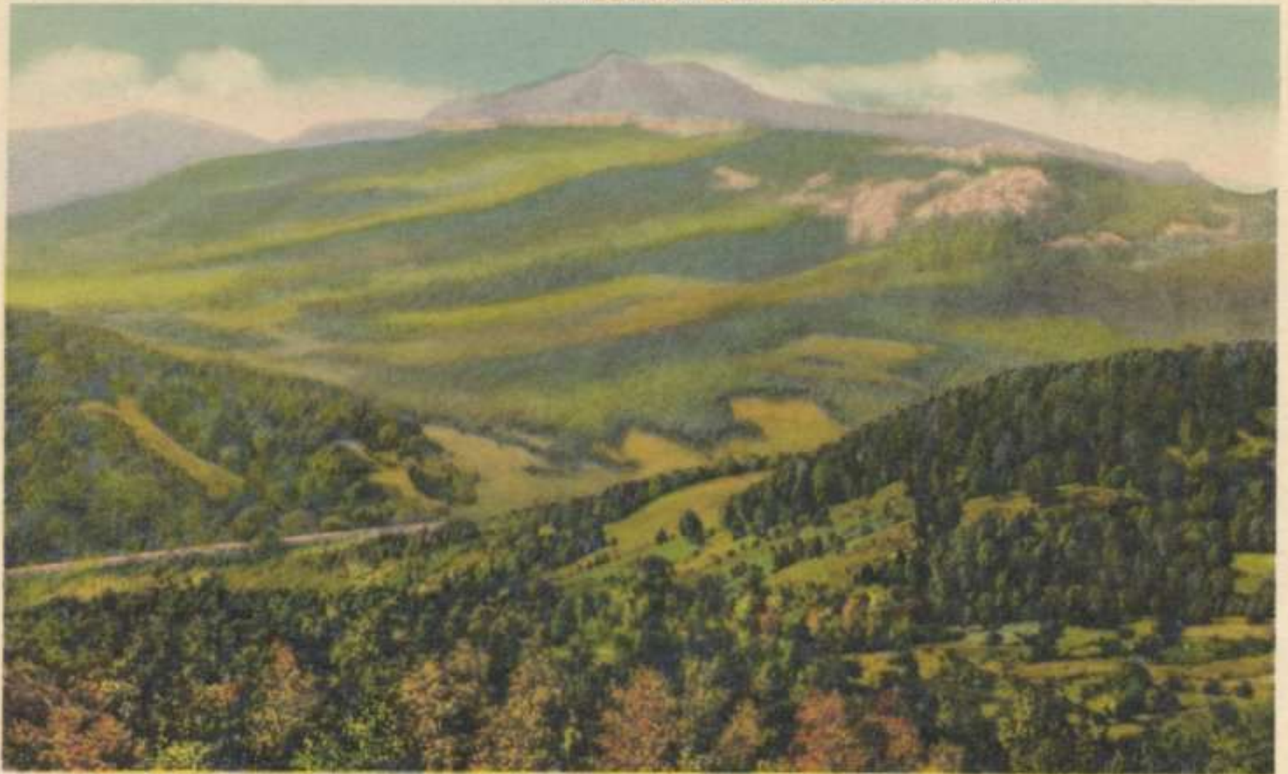
Camel's Hump, Green Mountains, Vermont