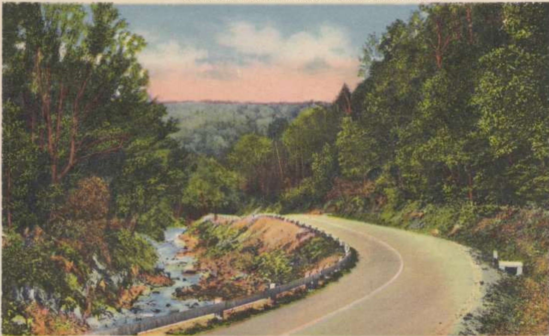
Molly Stark Trail Looking Toward Bennington, VT.