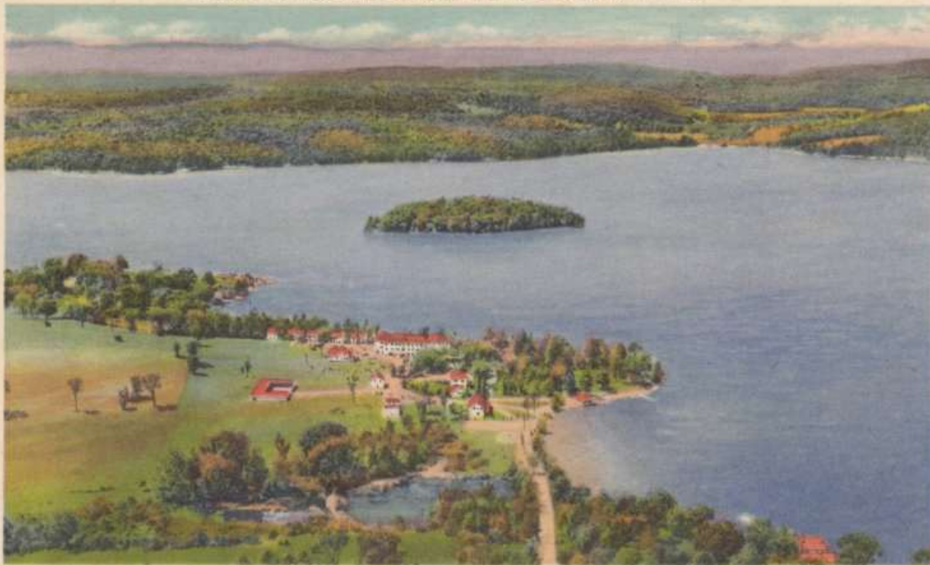
Airplane View of Lake Bomoseen in the Green Mts., Vermont