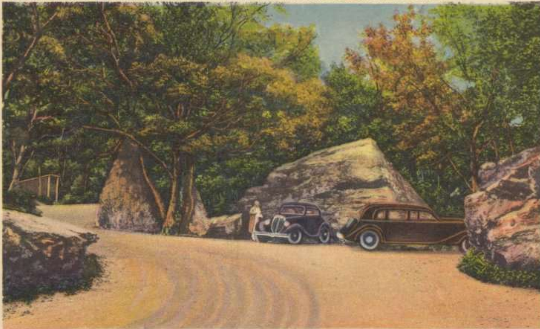
Where the road winds between giant boulders in Smugglers Notch, Green Mts., VT.

WHERE THE ROAD WINDS BETWEEN GIANT BOULDERS IN SMUGGLERS NOTCH, GREEN MTS., VT.