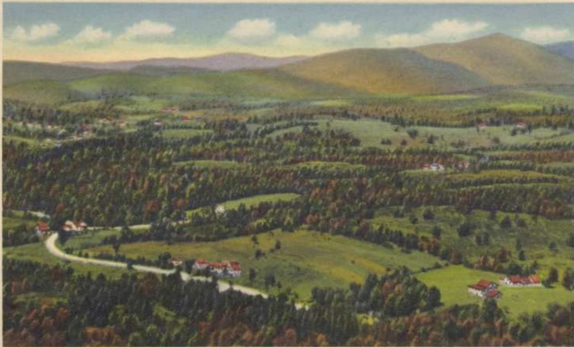
Looking towards Wilmington from Fire Tower on Mount Olga, Molly Stark Trail, Brattleboro