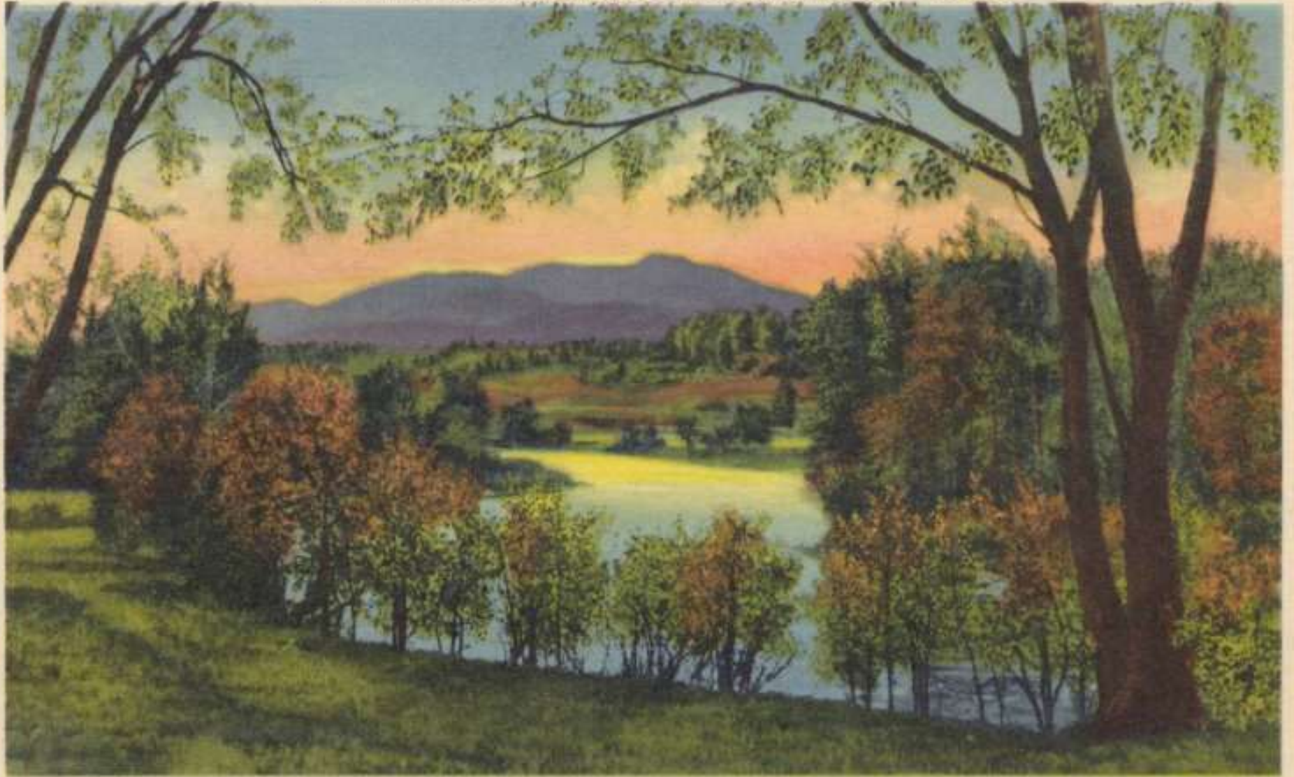
Mt. Mansfield and Lamoille River, Green Mts. of Vermont