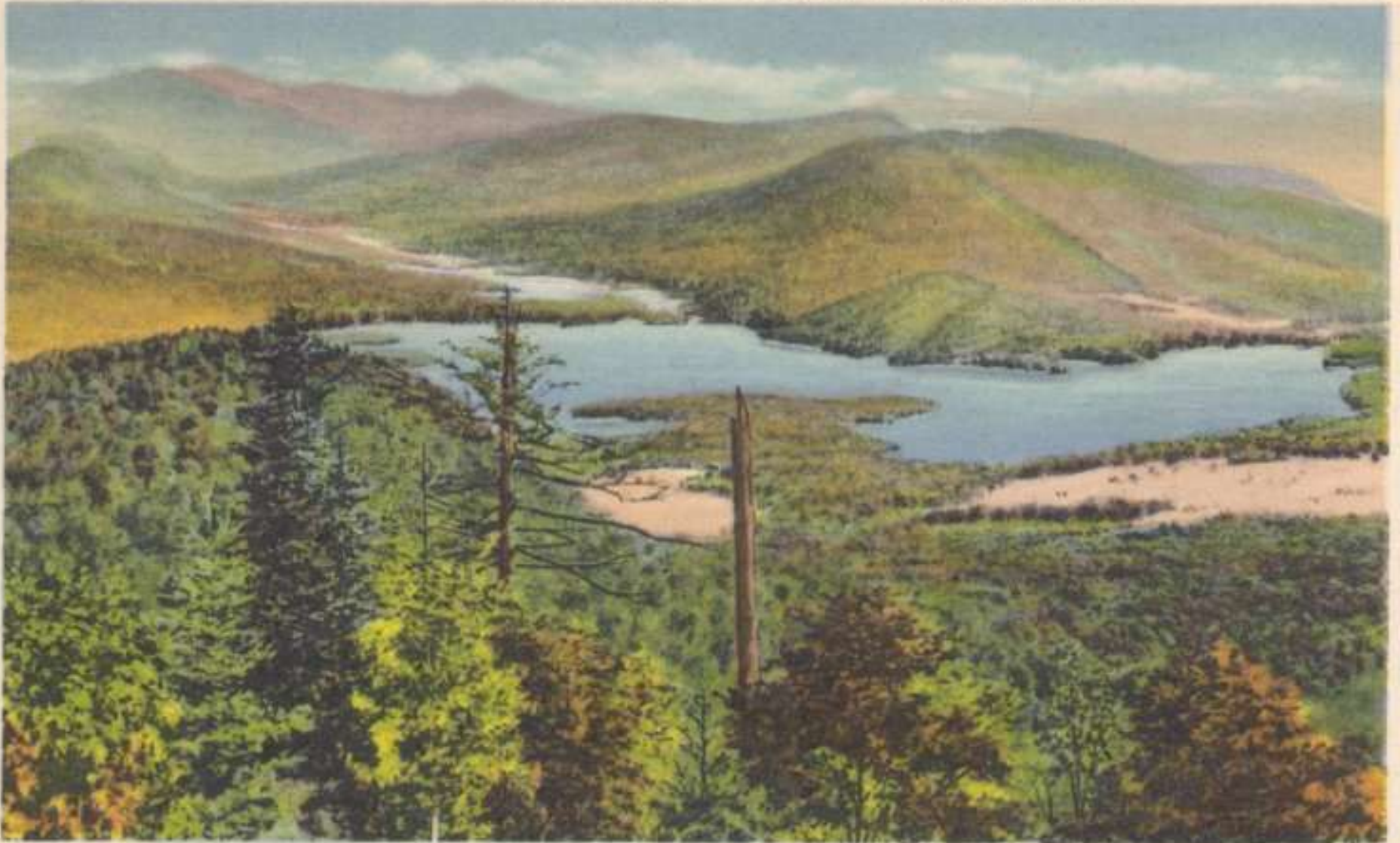
Chittenden Dam in the Green Mountains, Vermont