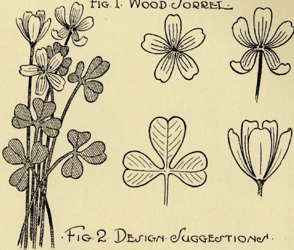
FIG. 2. DESIGN SUGGESTIONS.