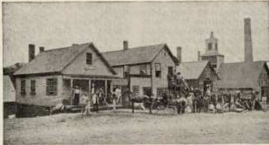
THE SULLIVAN MACHINE COMPANY IN 1869.