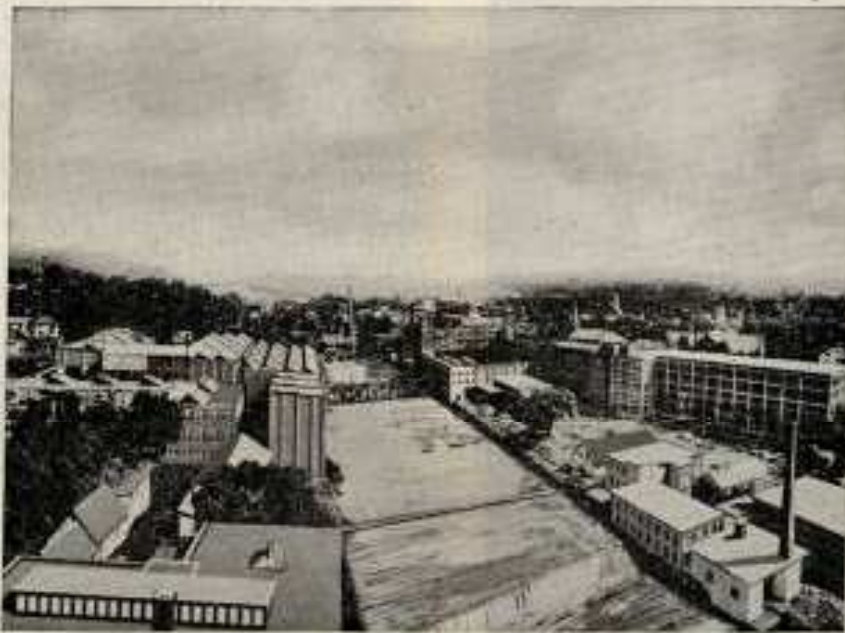
WORKS OF SULLIVAN MACHINERY COMPANY, 1921.